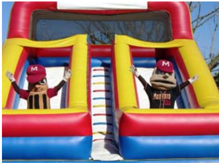
Come See The Most Extensive Traveling Baseball Festival In History

Principal Financial Group Family Fun Fest is an unprecedented, and completely free, celebration of baseball which will be visiting minor league baseball ballparks all across the country during its 5th anniversary season. It is the most extensive traveling baseball festival in history and features more than 20 baseball themed attractions including a minor league baseball museum, the Xbox 360 Best Buy Home Run Derby video game trailer, and a fan festival midway with batting and pitching cages, bungee runs, a huge side-by-side giant slide, baseball bounce houses, and lots more interactive fun for baseball fans of all ages. This year Days Inn is bringing a baseball card attraction where fans can step up to the plate and have their picture taken on their very own baseball card. There's even an exhibit where fans can put themselves on a free souvenir cover of Sports Illustrated Kids Magazine.